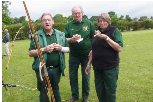
All smiles from the Bridlington archers as they get their daily dosage of cholesterol .