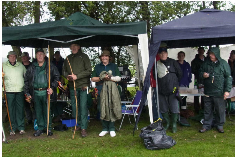
A short break in transmission.